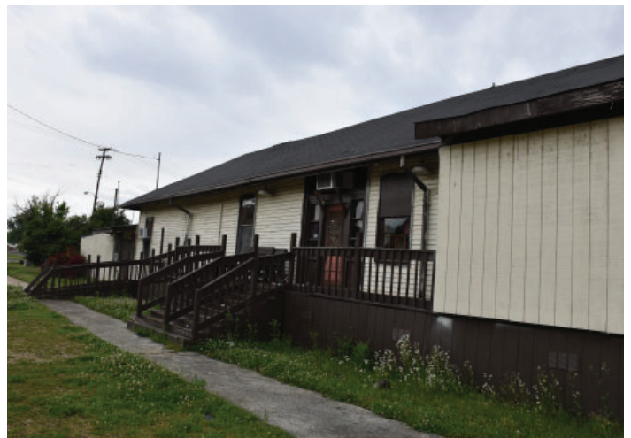
Street-side entrance to the depot.