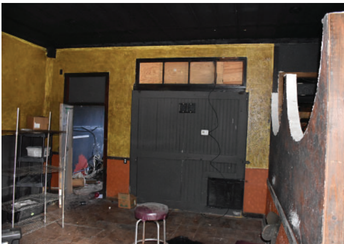
Freight room with remaining transom and sliding freight door.