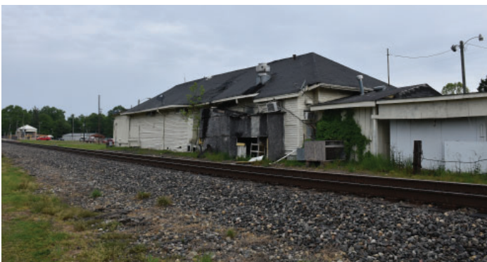
Railroad-side view of the depot.

The requested funds would stabilize and restore the depot, as well as develop the surrounding site to accommodate its new use as the home of a farmers market.