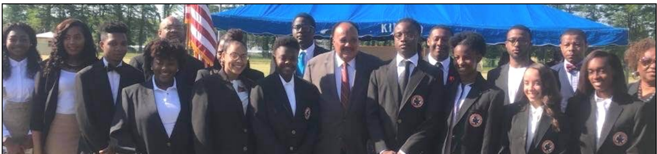
2018 Quitman County School District Lackey Scholars, Staff & Martin Luther King, III